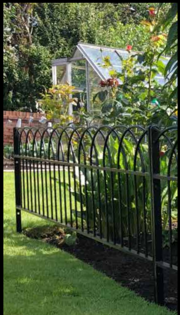
No. H 758.

This item should not be confused with lightweight, low specification alternatives that may be available elsewhere.